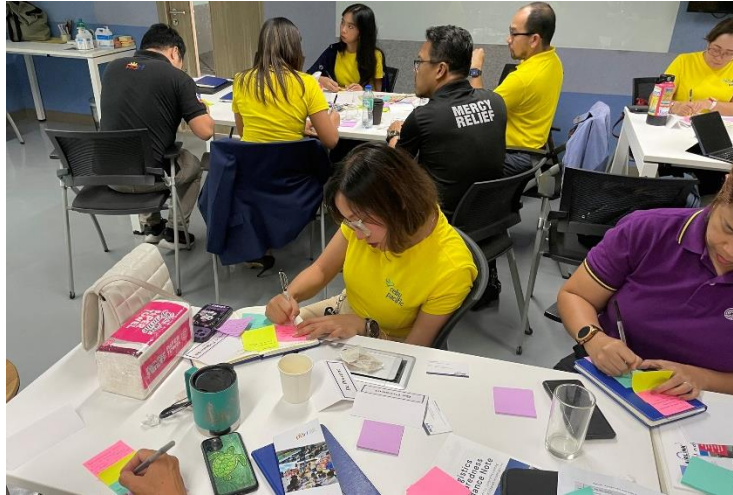
Participants during one of the training sessions